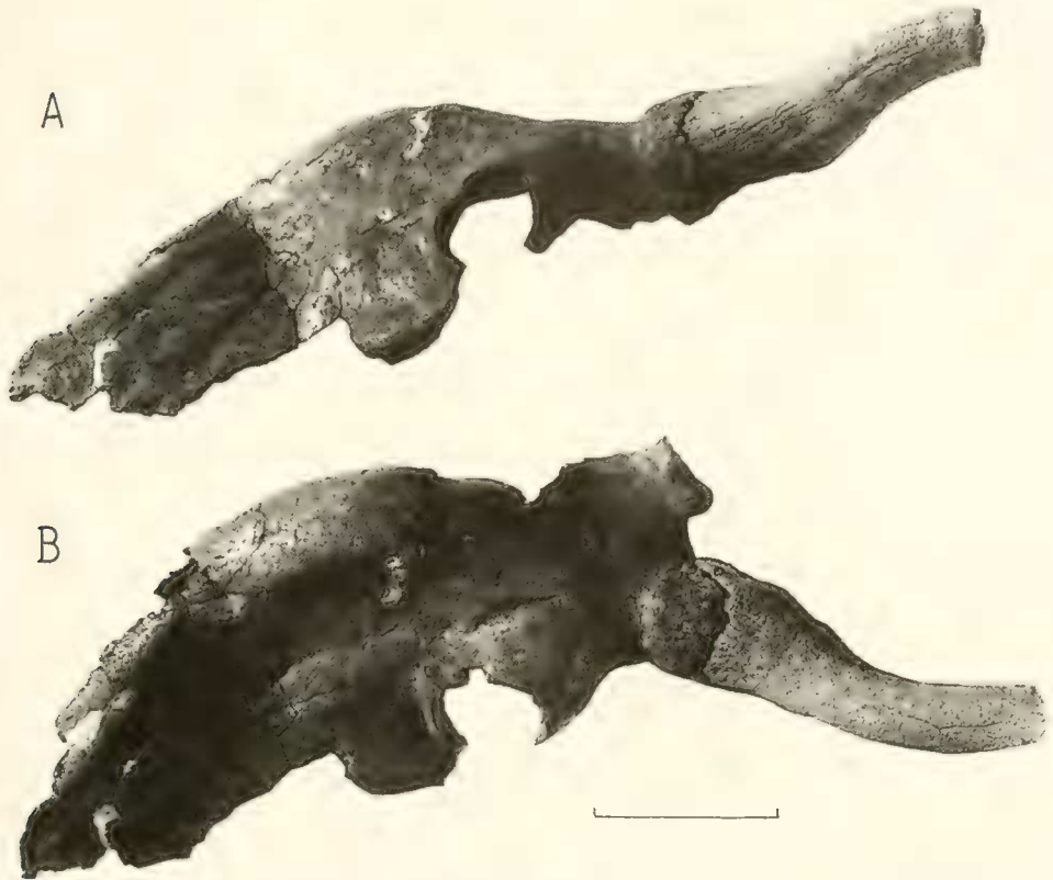
Fig. 3: Holotype face of Rhynotragus semiticus , VII-1111, with left horn core VI-306 attached to it, in (A) lateral and (B) dorsal views. Scale = 10 cm.

1978, VRBA 1985, HARRIS 1991, KLEIN & CRUZ-URIBE 1991). Accordingly the International Commission on Zoological Nomenclature is being petitioned by A.W. & A. GENTRY to conserve the usage of the familiar names Megalotragus and M. kattwinkeli . A further decision is needed from the Commission as to whether the London neotype or the rediscovered holotype of Megalotragus kattwinkeli shall function as future name-bearing type of that species. The London neotype is a more complete specimen of known stratigraphic provenance. Against this the Munich holotype has a very considerable historic interest and it would be satisfying to restore its name-bearing status. Moreover, if at a future date, our assertion of the conspecificity of neotype and holotype were challenged, and if the holotype were again the name bearer, then kattwinkeli would continue to be the name of the species which SCHWARZ had founded.